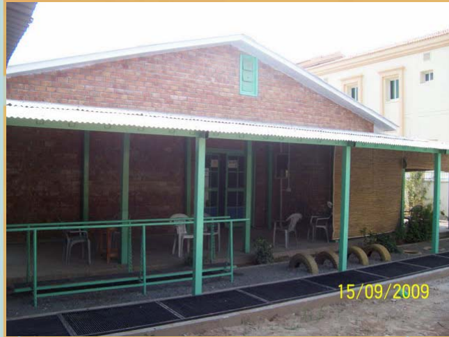
MPRC, RED CROSS & ERRA , MOZAFFARABAD