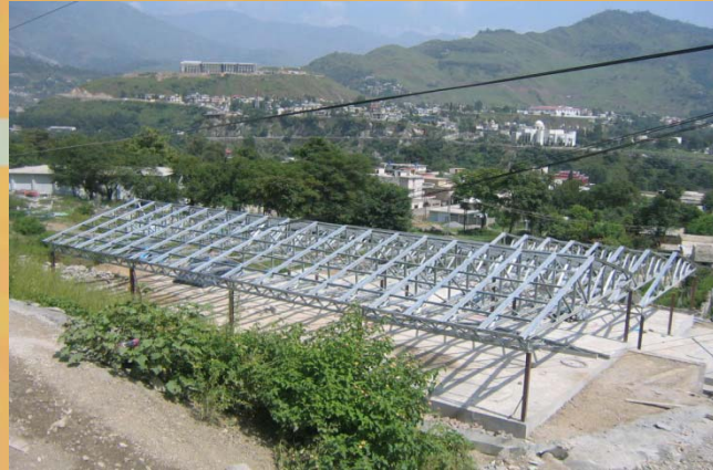
MIDDLE SCHOOL UNESCO PROJECT NAL