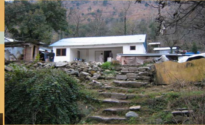
MAJOHI REHABILITATION PROJECT