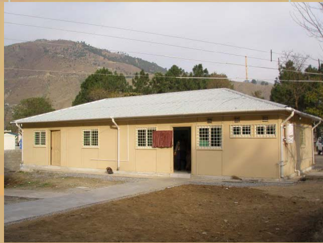
SERRA OFFICE AJ&K