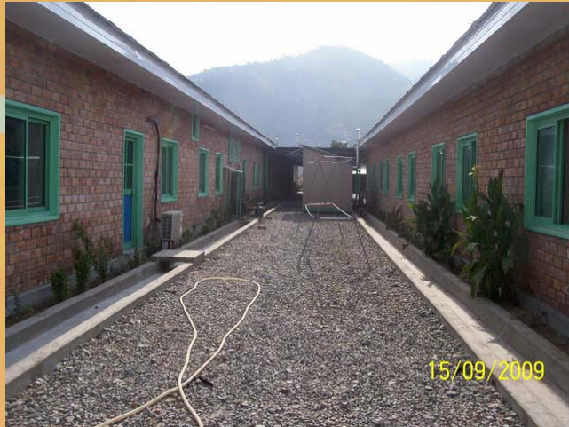
MPRC, RED CROSS & ERRA , MOZAFFARABAD