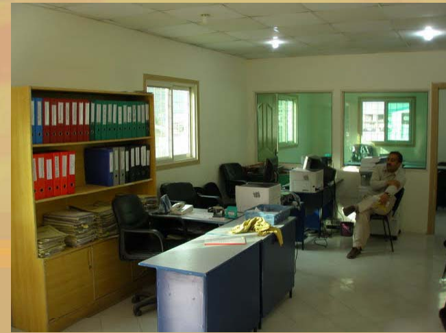
SERRA OFFICE AJ&K