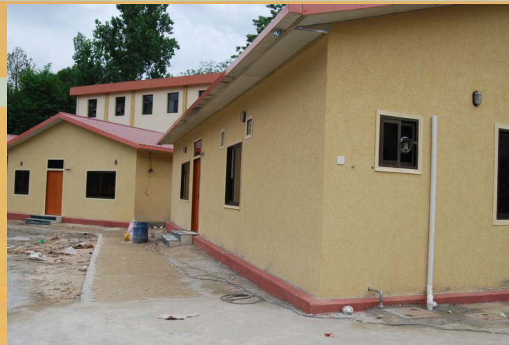
Arc Housing Bagh